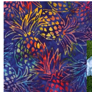
Batik and Tie Dye!