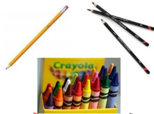
Dandy drawing tools!