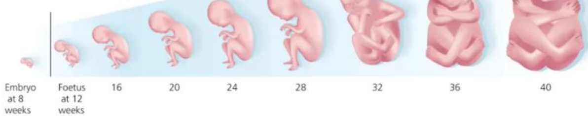
Foetal growth from 8 to 40 weeks

In what ways does your body change as you go through puberty?